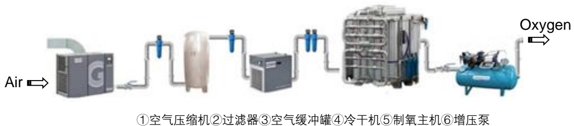
图 2. COSS 的结构组成与原理