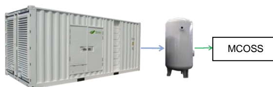
Figure2. Structure Compose and the principle of the COSS